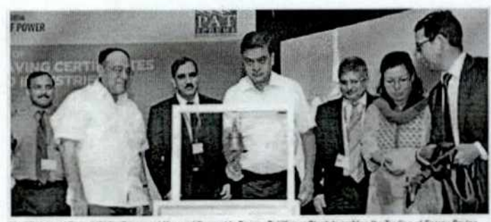
The Minister of State (VC) for Power and New and Renewable Energy, Raj Kumar Singh launching the Trading of Energy Saving Certificates-2017 at a function in New Delhi on Tuesday.