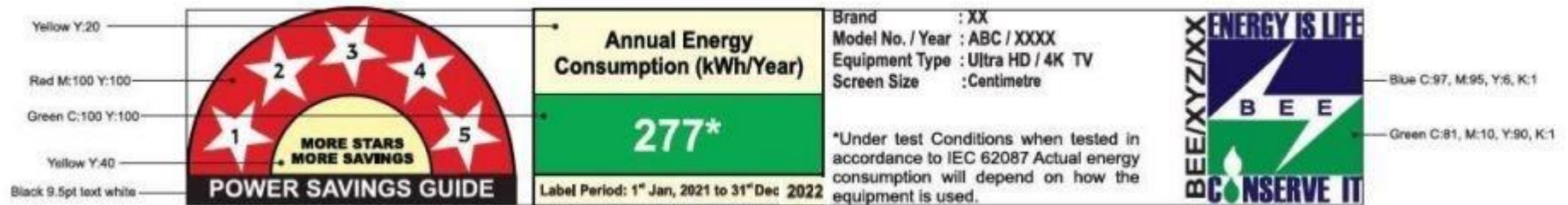
Figure 2: Colour scheme for UHD TV Star Label